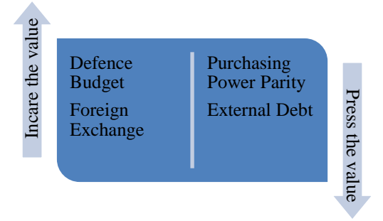
Fig. 3. The Research Conclusion & Suggestion (Data processed by researchers, 2023)

The findings demonstrate the significant impact of the defense budget on military strength, highlighting the importance of allocating sufficient financial resources to enhance defense capabilities. Additionally, foreign exchange was identified as a factor influencing military strength, emphasizing the need to monitor and manage currency exchange rates to maintain a favorable position for defense investments. Moreover, the study revealed that managing purchasing power parity and external debt is crucial in maintaining a strong military. It is recommended for governments and relevant organizations to carefully balance purchasing power parity to ensure affordable procurement of defense equipment and resources. Furthermore, effective management of external debt is essential to prevent excessive financial burdens that could negatively affect military capabilities.