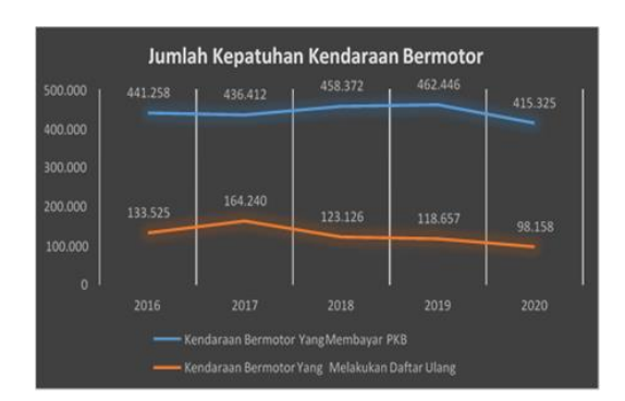
Figure 1.1 Number of Motorized Vehicle Compliance in Region I Pajajaran, Bandung City

The following is the number of motorized vehicle compliance in region I Pajajaran Bandung City: