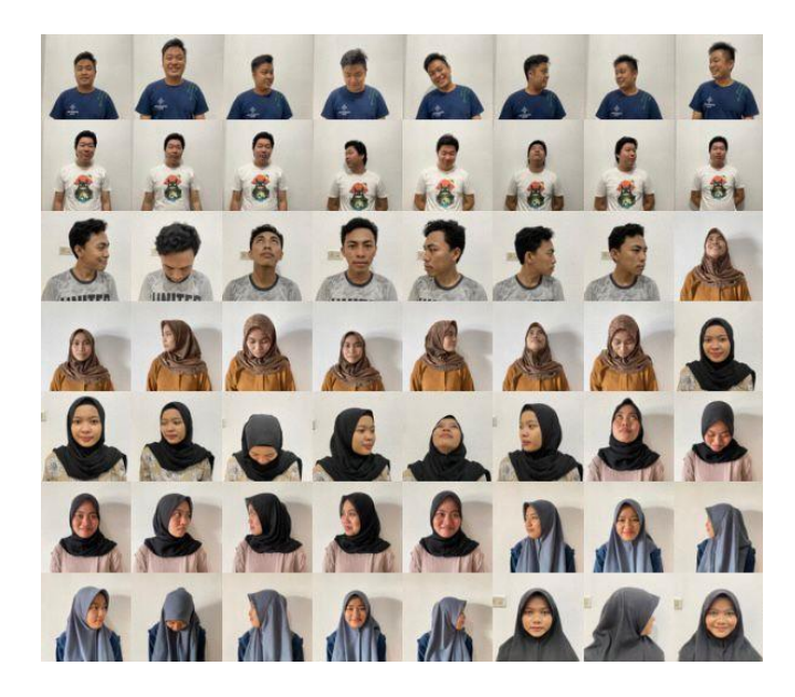
Figure 3. Example of employee image dataset