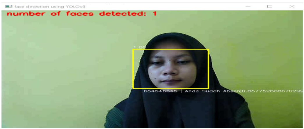
Figure 8. Test Results

From the test results display the nip and information that has successfully performed attendance, and then the data will be entered into the attendance data website as shown in Figure 9 below: